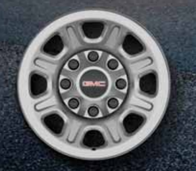
18" Painted Steel (PYT) Available on 2500HD Sierra