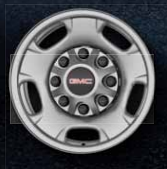
17" Painted Steel (PYN) Standard on 2500HD Sierra