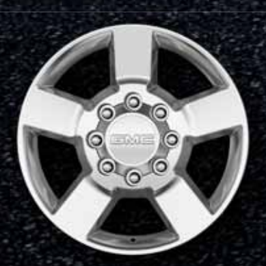
20" 5-Spoke Polished Aluminum (PYU) Available on 2500HD SLE

18" Black Painted Aluminum (RT4) Included and Only Available With All Terrain X Package