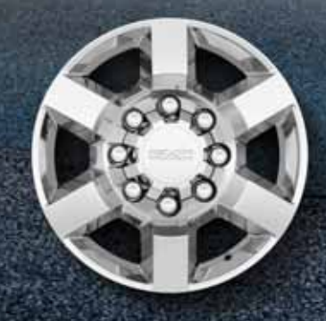
18" Chromed Aluminum (PYR) Standard on 2500HD SLT; Included on 2500HD All Terrain; Available on 2500HD SLE