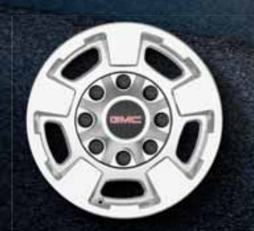
17" Machined Aluminum (PYQ) Standard on 2500HD SLE; Available on 2500HD Sierra