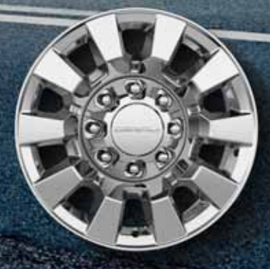
20" Chromed Aluminum (RQA) Standard on 2500 Denali HD