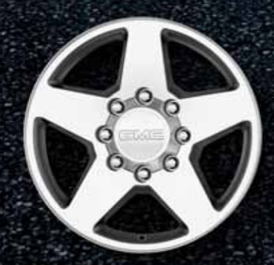
20" 5-Spoke Polished Aluminum With Dark Argent Accents (RTH) Available on 2500HD All Terrain