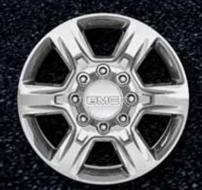
20" 6-Spoke Polished Aluminum (Q7R) Available on 2500HD SLT