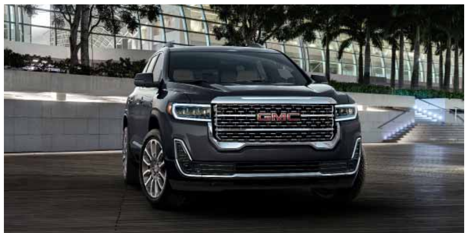
AT4 includes most SLT standard content and adds a 3.6L V6 engine, cloth or available perforated leather-appointed first- and DENALI includes most SLT standard content and is embellished with premium features such as a 3.6L V6 engine, unique 20" wheels, an automatic heated steering wheel, ventilated front seats, heated second-row outboard seats, Navigation,<sup>3</sup> Forward Collision Alert<sup>2</sup> Automatic Emergency Braking<sup>2</sup> and power-folding mirrors.

ACADIA SLT IN RED QUARTZ TINTCOAT, ACADIA DENALI IN CARBON BLACK METALLIC AND ACADIA AT4 IN SUMMIT WHITE, ALL SHOWN WITH AVAILABLE EQUIPMENT.