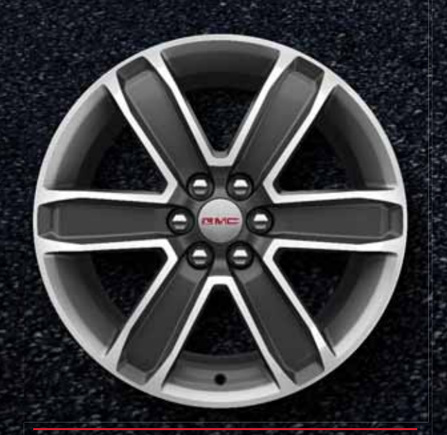
20" Ultra-Bright Machined Aluminum (SHV)<sup>1</sup> — Available on SLT

18" Machined Aluminum (RD9) — Standard on SLT