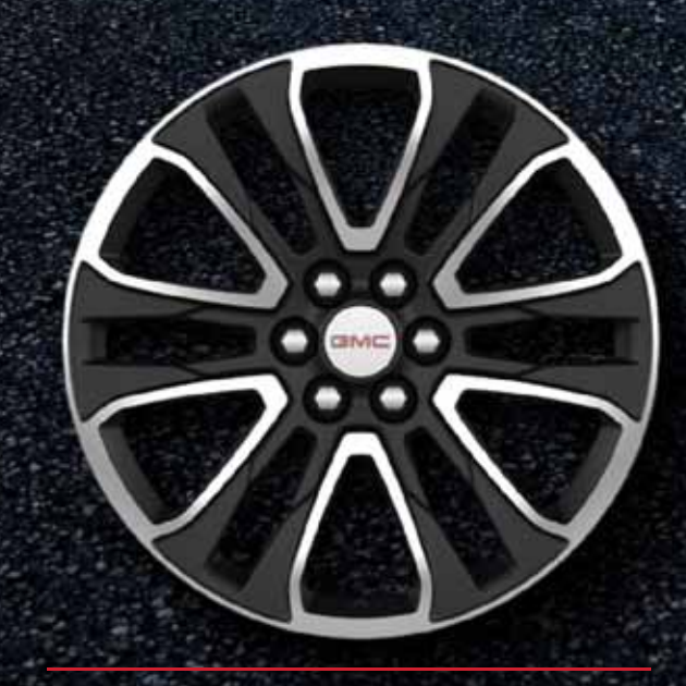
20" Machined Aluminum With Dark Accents (SSZ) — Available on AT4