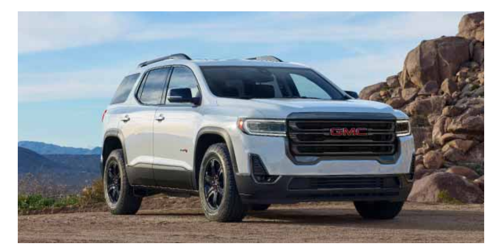
second-row seats, an advanced twin-clutch AWD system, Hill Descent Control, Hill Start Assist, all-terrain tires, premium heavyduty floor mats, a Cargo Management System (two-row models) and an Off-Road mode within the Traction Select System.