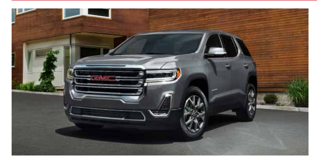
SL/SLE models come with a 2.5L engine on FWD models and a 2.0L Turbo engine (late availability) on SLE AWD models, a 9-speed SLT includes most SLE standard content and adds features such as a 2.0L Turbo engine (late availability), perforated automatic transmission, LED headlamps and taillamps, cloth seating, the next-generation 8" diagonal infotainment system? Smart Slide flat-folding second-row seats, Lane Change Alert with Side Blind Zone Alert? Rear Cross Traffic Alert2 and Rear Park Assist? (SLE shown.)