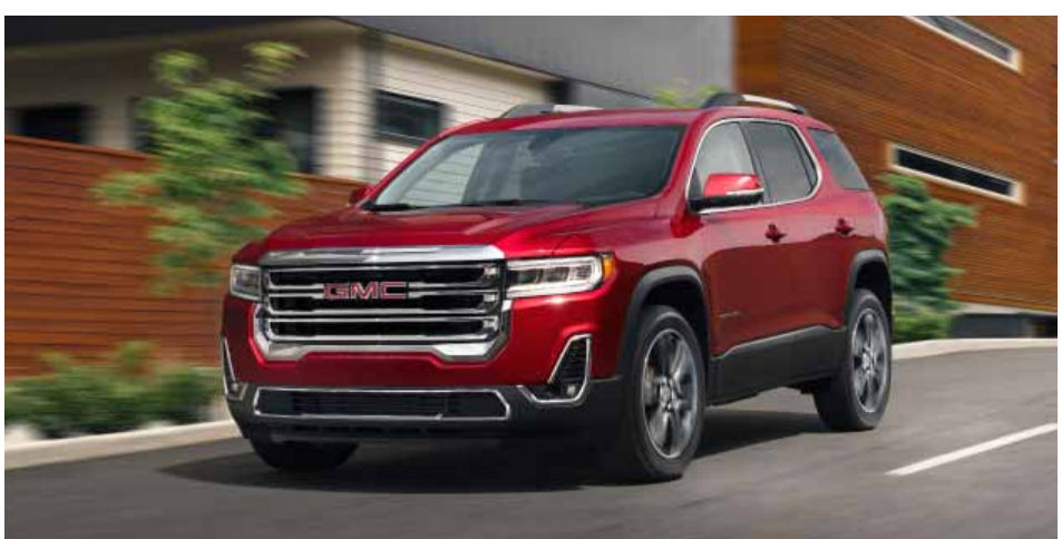
leather-appointed first- and second-row seats, LED fog lamps, a hands-free programmable power liftgate with GMC logo projection, an 8-way power-adjustable driver seat, remote start and a Traction Select System.