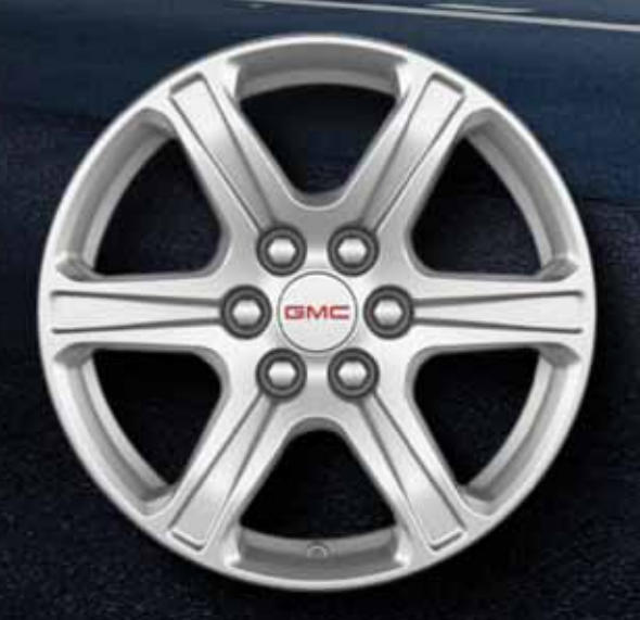
17" Painted Aluminum (RSC) — Standard on SL